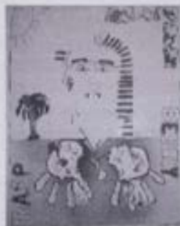
Untitled (Unknown date) Peter Daglish Lithograph on paper Acc #: U980.2.1