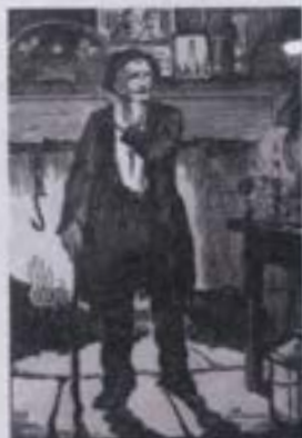
The Sanachie (1910-25) Jack Butler Yeats Ink and watercolour Acc #: U982.44.20