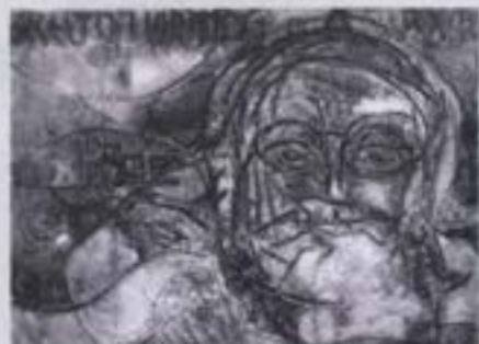
Skelton Writing a Poem (1974) Herbert Siebner Sgraffito and paint Acc #: U992.16.2