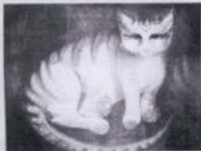
Still (1964) Pauline Berwick Lithograph on paper Acc #: U980.2.29