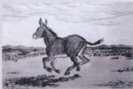
Evening (1910-25) Jack Butler Yeats Ink and watercolour Acc #: U982.44.10