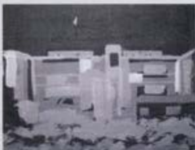
Untitled (1964) Bidy Gaddes Ink on paper Acc #: U999.20.6