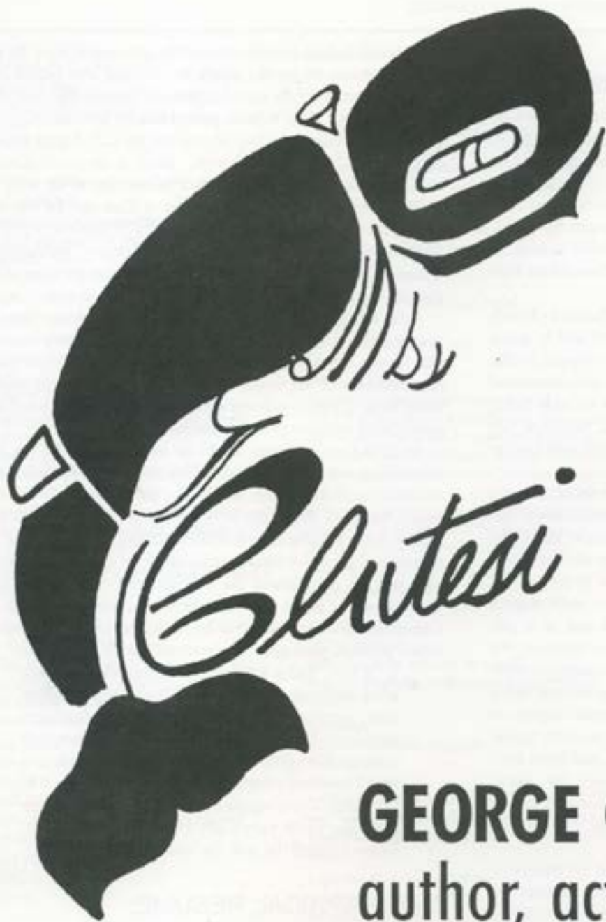
Illustration: Clutesi—the Whaler